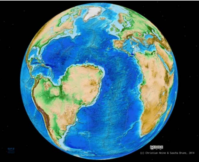
How Earth would have looked if rift had split continent differently.